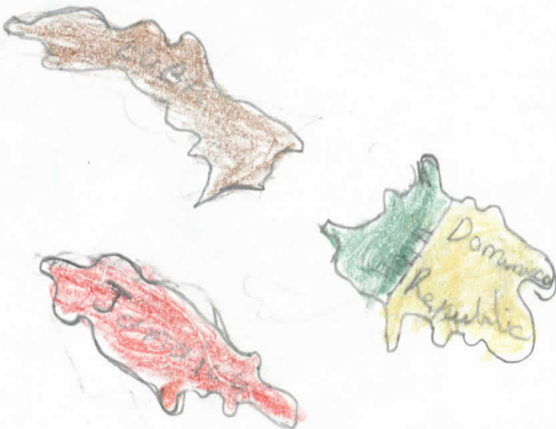
Draw a map that shows Jamaica. It can be any kind of map as long as it includes Jamaica.